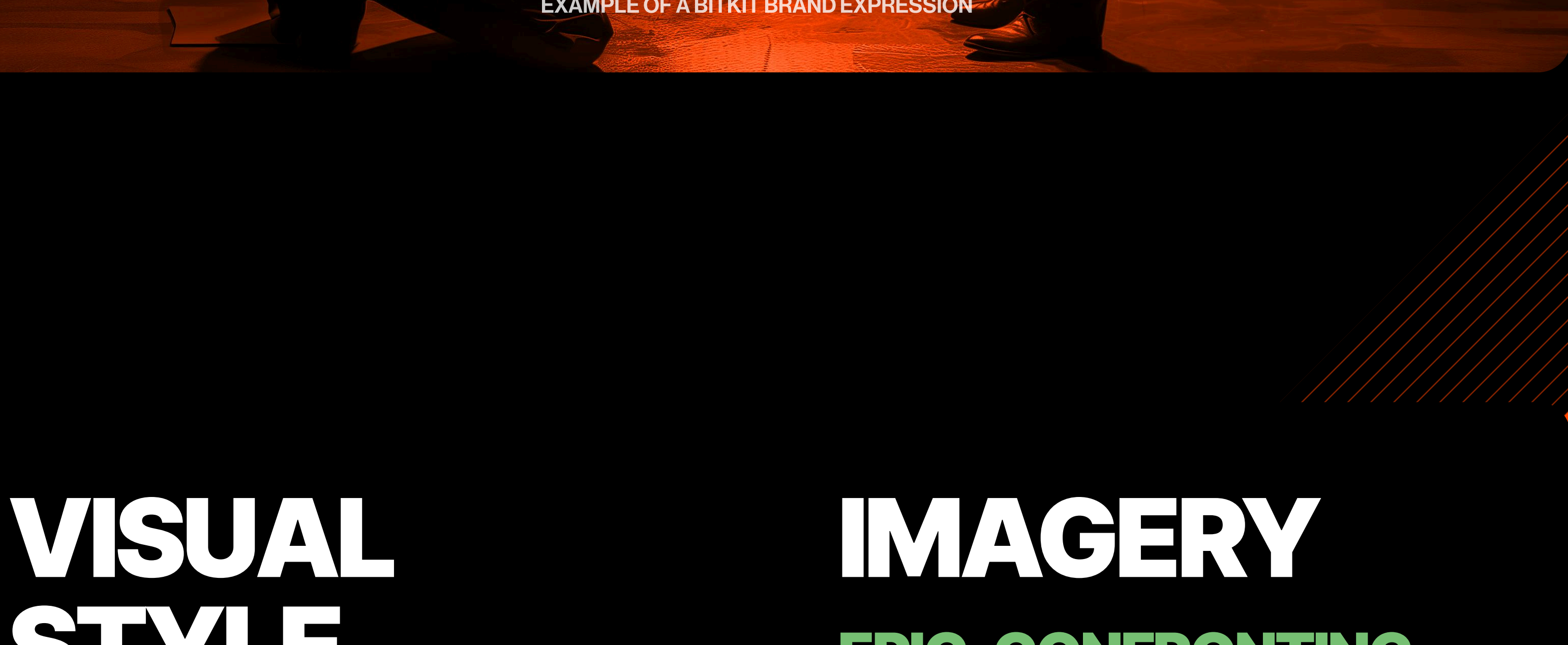
EXAMPLE OF A BITKIT BRAND EXPRESSION

Take control of your money, and you'll never have to beg for permission to spend it.